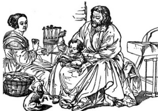
The Holy Family by Bartolome Esteban Murillo

"Tell them to do good, to be rich in good works, to be generous, ready to share"(1 Tim 6:17-19).